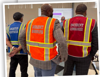
Emergency Preparedness Training in May

HABC staff attended an Emergency Tabletop Exercise to participate in a low-stress, discussion to talk through how HABC as an organization will respond to a hypothetical emergency in coordination with its key local partners. The goal was to figure out where the gaps and areas of improvement are, and then identify corresponding corrective actions moving forward.