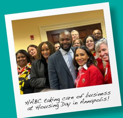
HABC taking care of business at Housing Day in Annapolis!