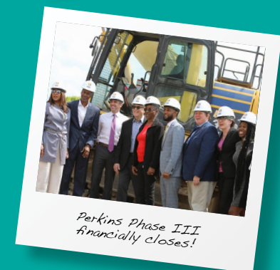
Perkins Phase III financially closes!

Be on the lookout for the 2nd Quarter Survey!